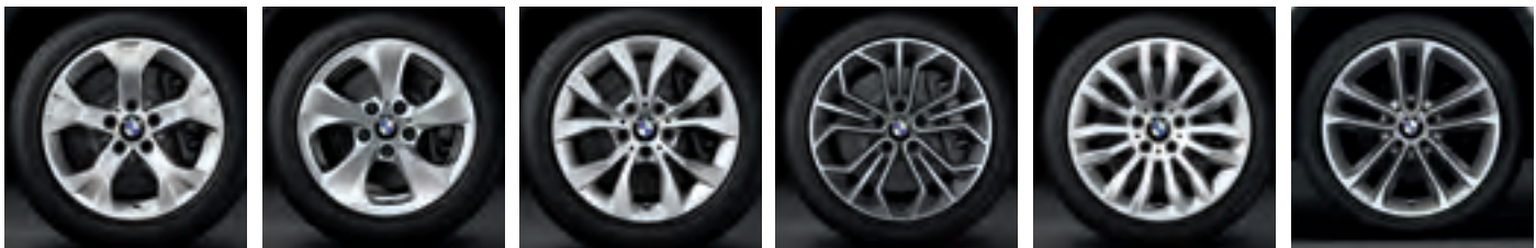
17" Star-spoke style 317 17" Streamline style 306 17" V-spoke style 318 18" Blade-spoke style 323 18" Double-spoke style 321 18" Double-spoke style 421