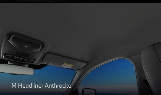
M Headliner Anthracite