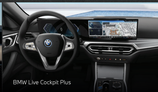
BMW Live Cockpit Plus