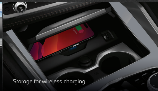
Storage for wireless charging